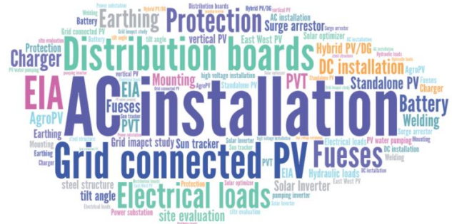
Fig. 2 Keyword cloud for PV system training topics in Palestine

As a result, the target groups of such training are engineers with degrees that are higher than diplomas. Thus, such courses cannot be classified as TVET courses, although some of them are being delivered by TVET centers.